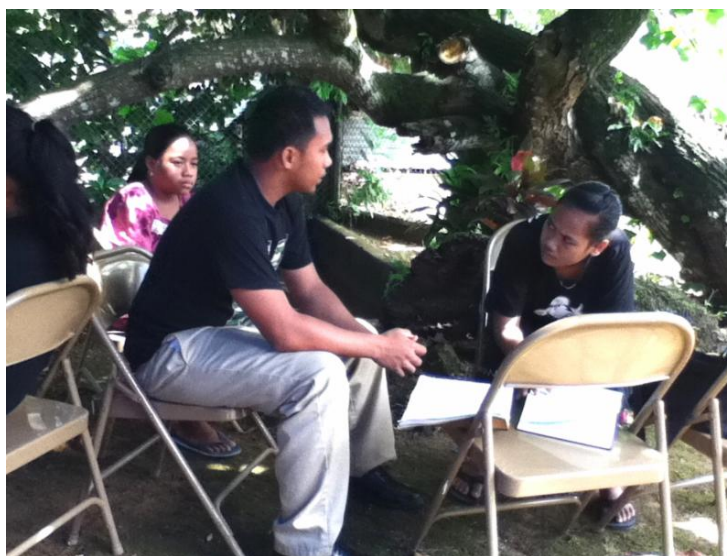
Harvest Baptist Bible College student (L) witnessing to waiting patient at